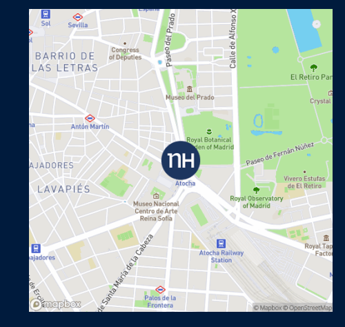
Sol City Center 1,5 Km / 7 min. Adolfo Suárez MadridBarajas Airport 15,9 Km / 22 min Chamartín trainstation 6,9 Km / 18 min. Atocha train station 0,1 Km / 2 min.

All our rooms have natural light, views of the Botanical Garden and permanent natural and mechanical ventilation with 100% new air. You will also have our in-house event planner.